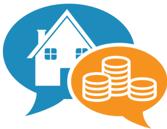
Example of Property Taxes for a $200,000 home in Gretna.