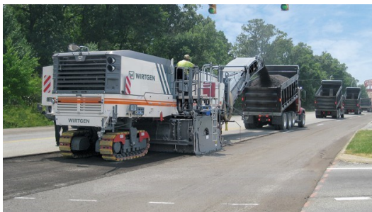
Cold milling will remove the upper section of the existing street surface.

Access to the homes and streets will be maintained during the cold milling operations with flaggers. Short term access restrictions will occur during the placement of the new asphalt paving.