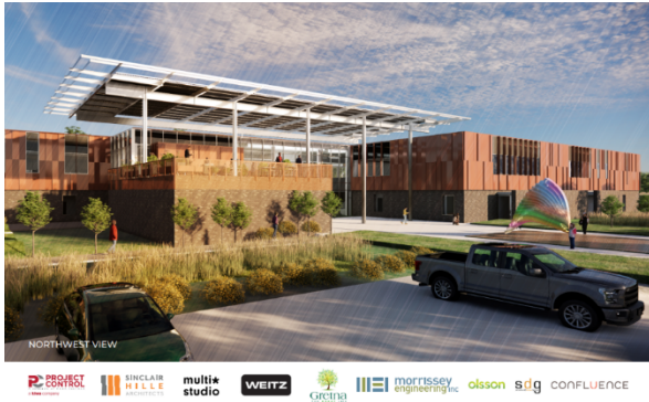
Front of building

Renderings of the building and property: