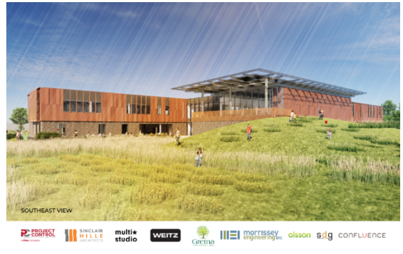
Back of building